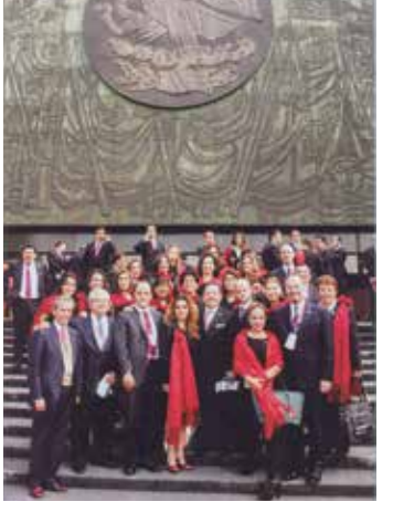
USMCOC board members and members of the Mexican Congress visiting Mexico Legistlative Palance during 2012 Electoral Observer's Mission.

The USMCOC has had the honor of serving as an International Observer to Mexico's presidential elections since 1994, as originally certified by IFE (Instituto Federal Electoral), now INE (Instituto Nacional Electoral since 2014). The USMCOC's delegations, composed of board members and U.S. congressmen, participate in an Observer's Mission to witness transparency and legality in the electoral process throughout Mexico. In both witnessing the electoral process and meeting with party representatives, the Chamber is proud to represent the impartial nature of the Chamber's mission, activities and relationships, and to confirm its reputation as an "honest broker" in the bilateral relationship.