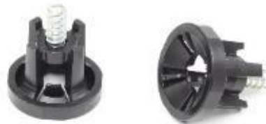
K50-HP Ball Socket