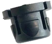
8mm Ball Socket