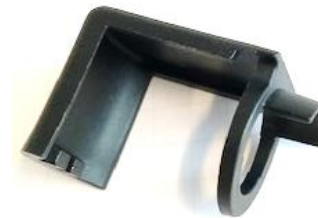
Lock Out Cover