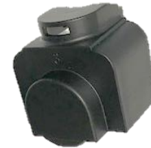
Lock Out Cover